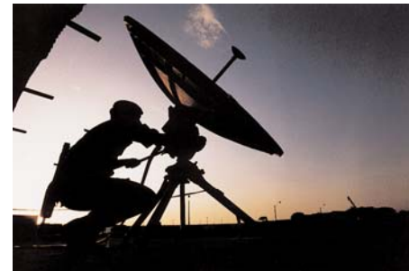
Delivering information to UK forces world-wide

Supported by the UK Defence Export Services Organisation (DESO) and within a gain-sharing framework with the MOD, Paradigm will also offer the same levels of service and security to other governments and organisations, such as NATO.